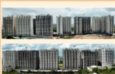
Work update - October 31*

The construction at Vasavi Urban is progressing steadily, with 9 out of 12 blocks (Blocks 1, 2, 4, 5, 6, 7, 9, 10, and 11) completed, while Block 3 (P1-23 floors, P2-22 floors) and Block 12 (8 floors) are under development. Non-tower work on the east and west sides is completed, with the central portion in progress. Finishes for Blocks 4, 5, 7, 10, and 11 are completed, while Blocks 1, 2, and 6 are still in progress, alongside screed works in the basements. MEP works are completed for Blocks 4, 5, 7, 10, and 11, with Blocks 1, 2, and 6 ongoing, and four lifts are being installed. External texture work is completed for Blocks 4, 7, and 10, while Blocks 1, 2, 6, and 11 are nearing completion.