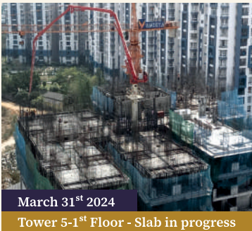
March 31 st 2024 Tower 5-1 st Floor - Slab in progress