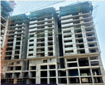
March 31 st 2024 Tower 1-13 th Floor - Slab in progress

With construction in full swing, we are proud to announce that the 11th floor is currently underway, with plans to hand over the interiors by December 2025. Our commitment to timely delivery ensures that your dream home becomes a reality right on schedule.