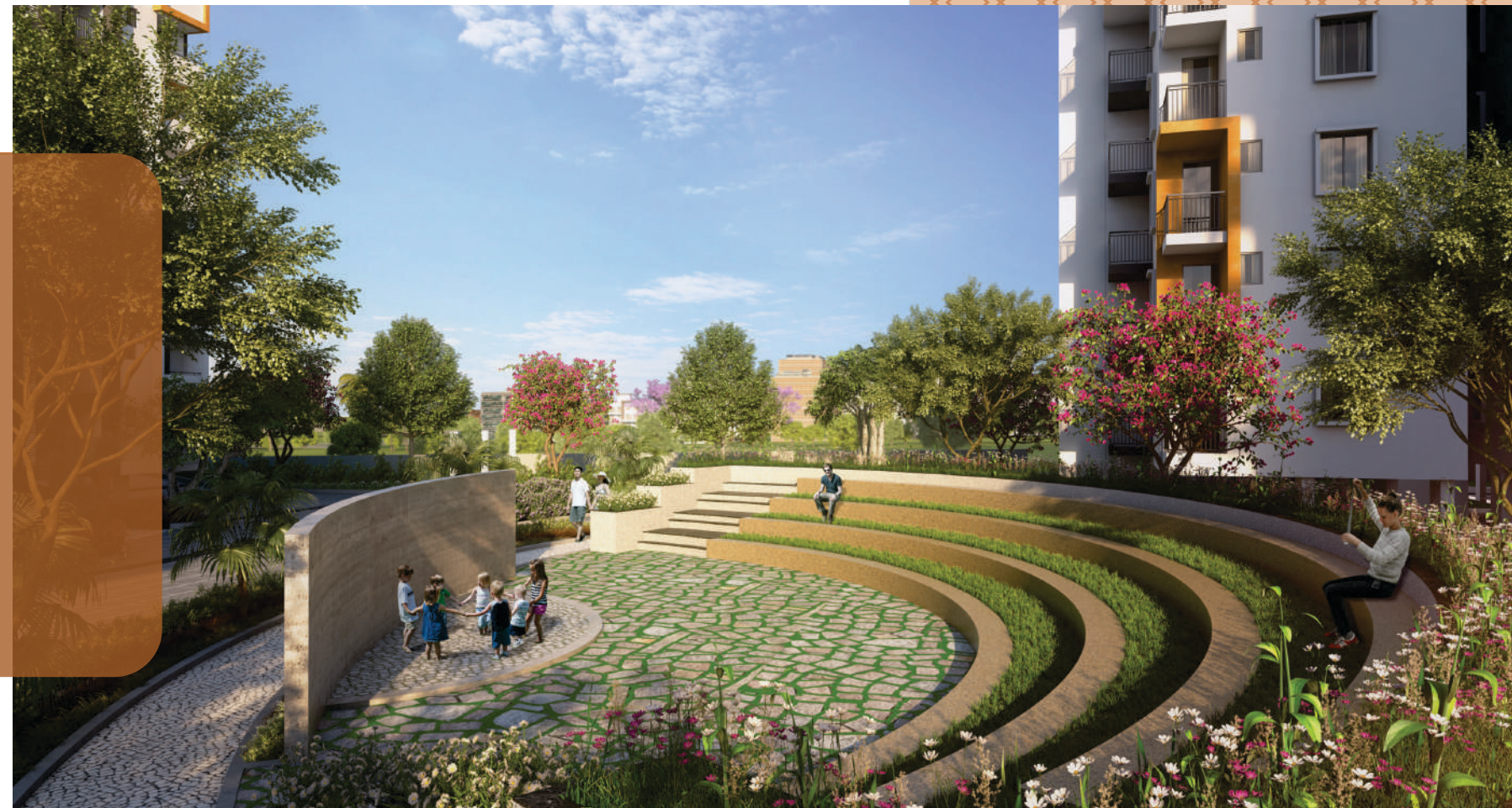
amphitheatre through lush landscapes