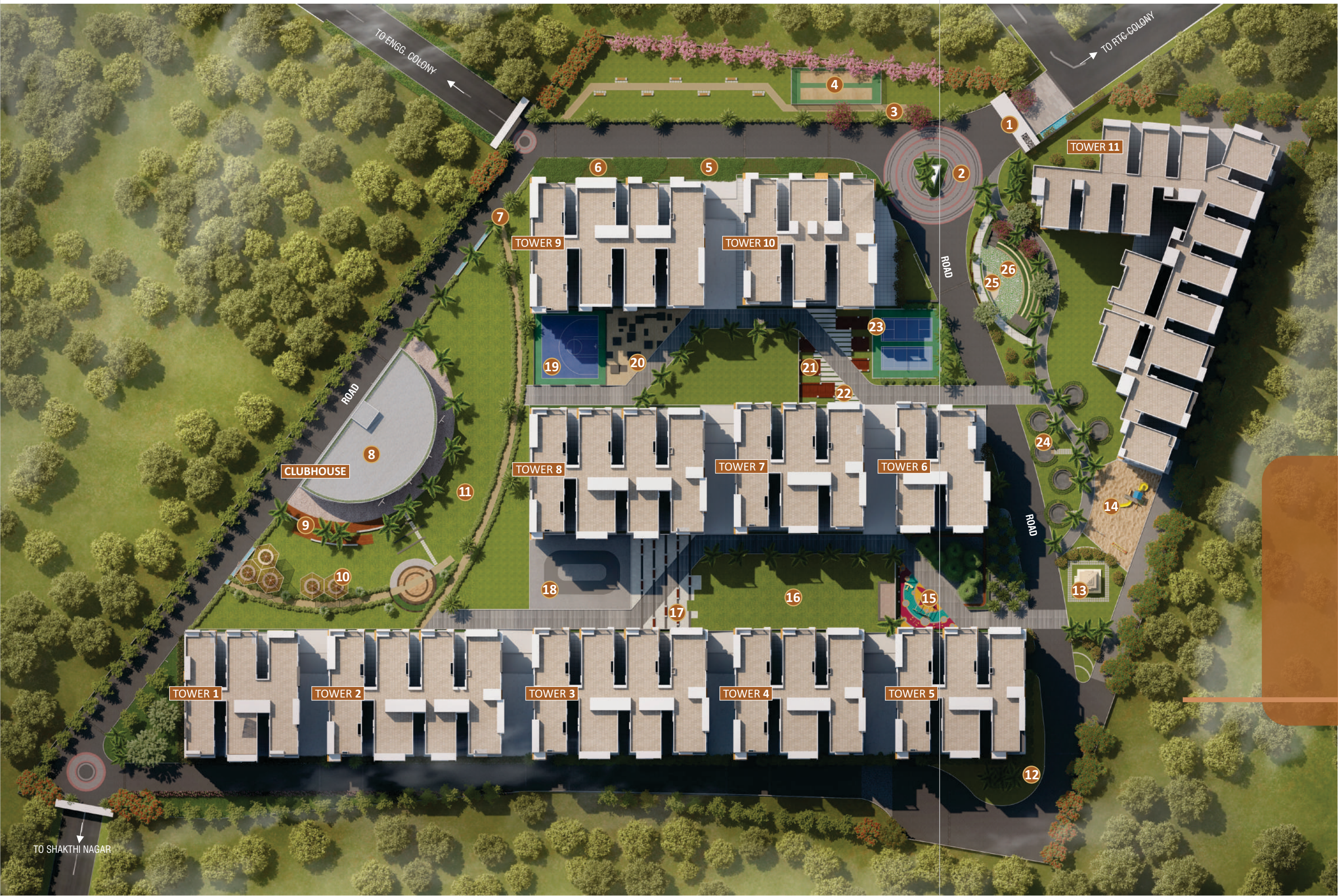
Master Plan view