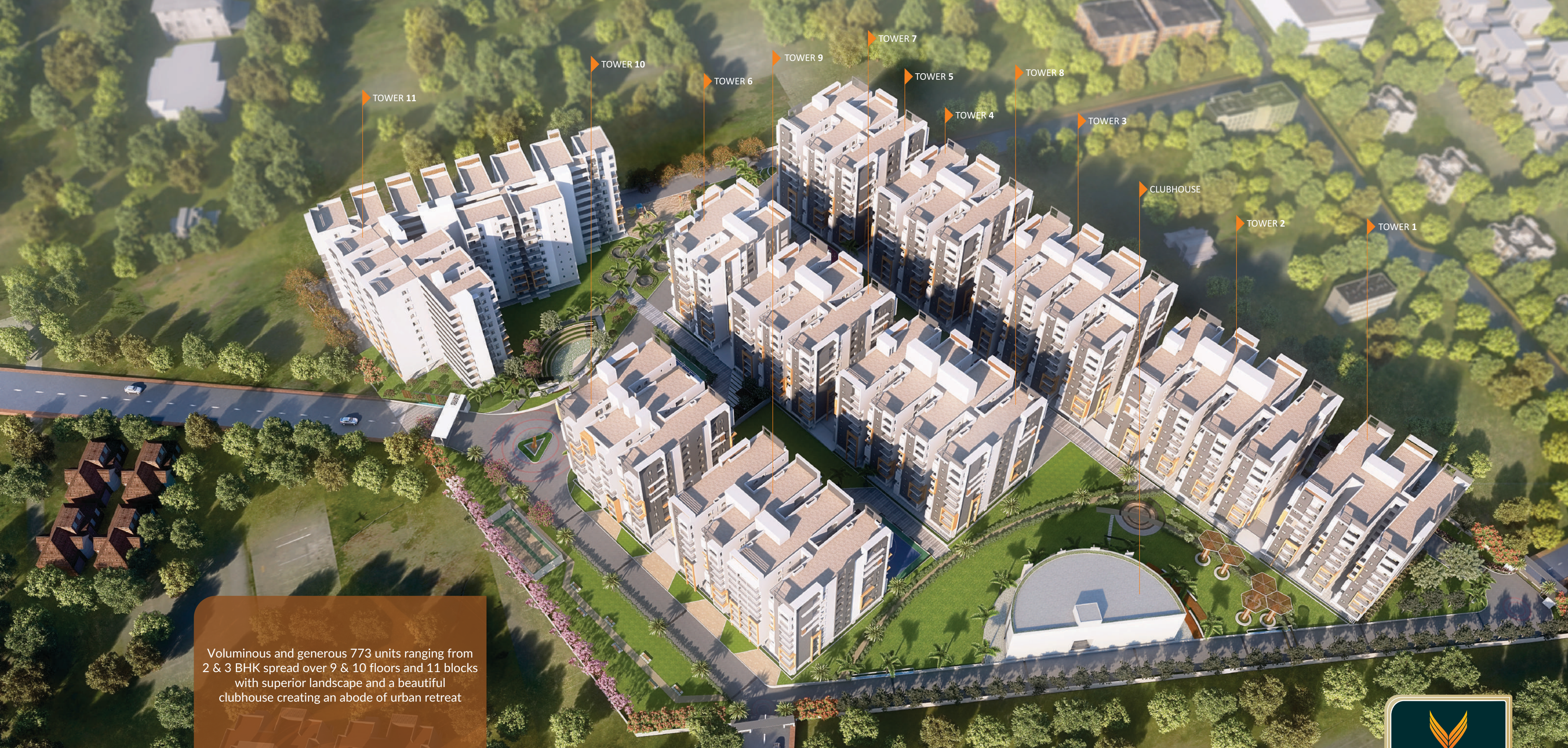
Birds eye view

Voluminous and generous 773 units ranging from 2 & 3 BHK spread over 9 & 10 floors and 11 blocks with superior landscape and a beautiful clubhouse creating an abode of urban retreat LIFE AND VITALITY