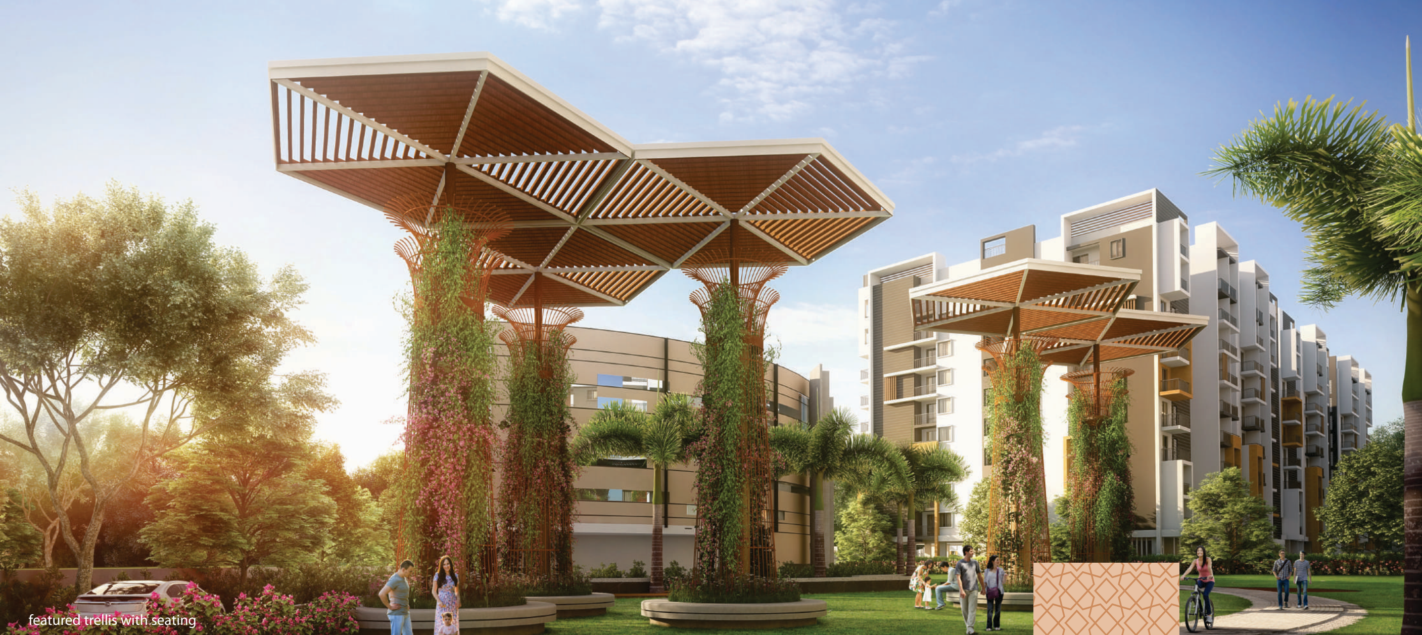
featured trellis with seating