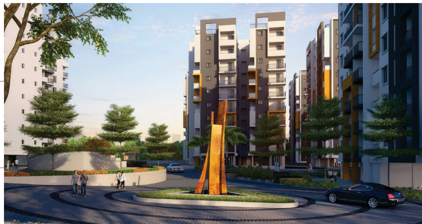
sculptured feature at arrival for warm welcome

REVEL IN THE SPLENDOUR OF YOUR SURROUNDINGS