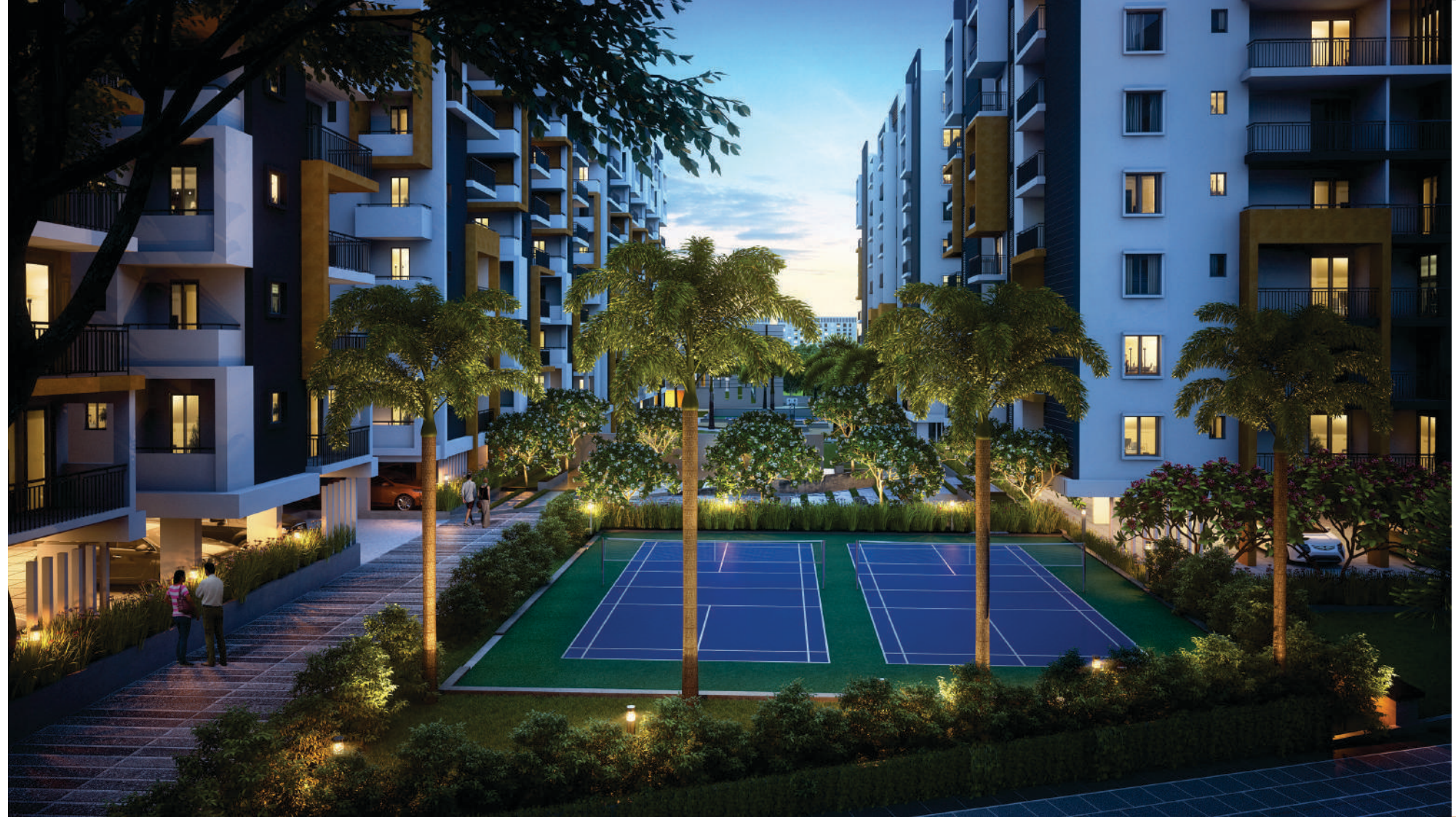
Multi purpose court

A walk through the greens You would agree that there isn't a better note to end the day on, even when you're already looking forward to the promise of the next one, which would be nothing like expected.