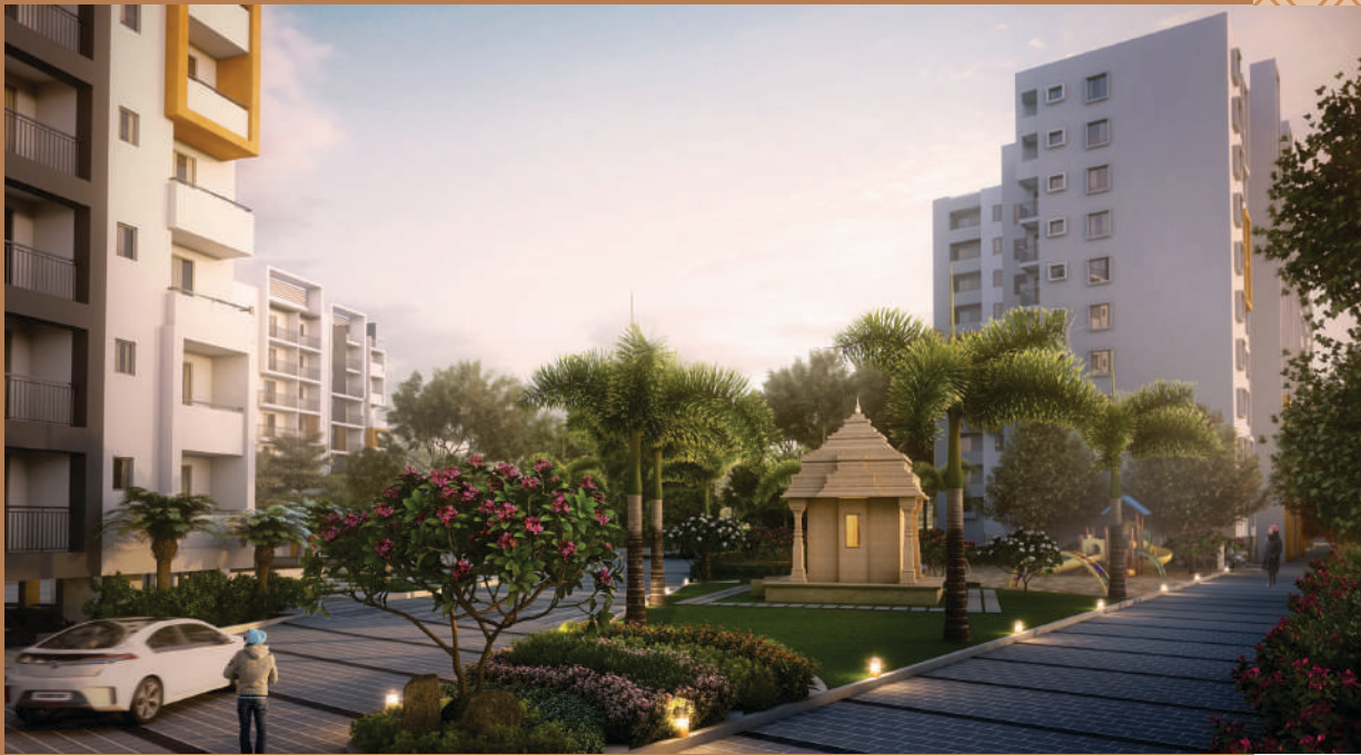
Viwe towards temple landscape