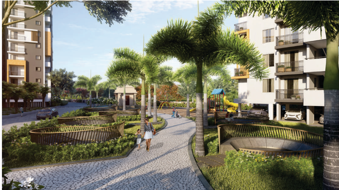
ambient seating within lush landscape