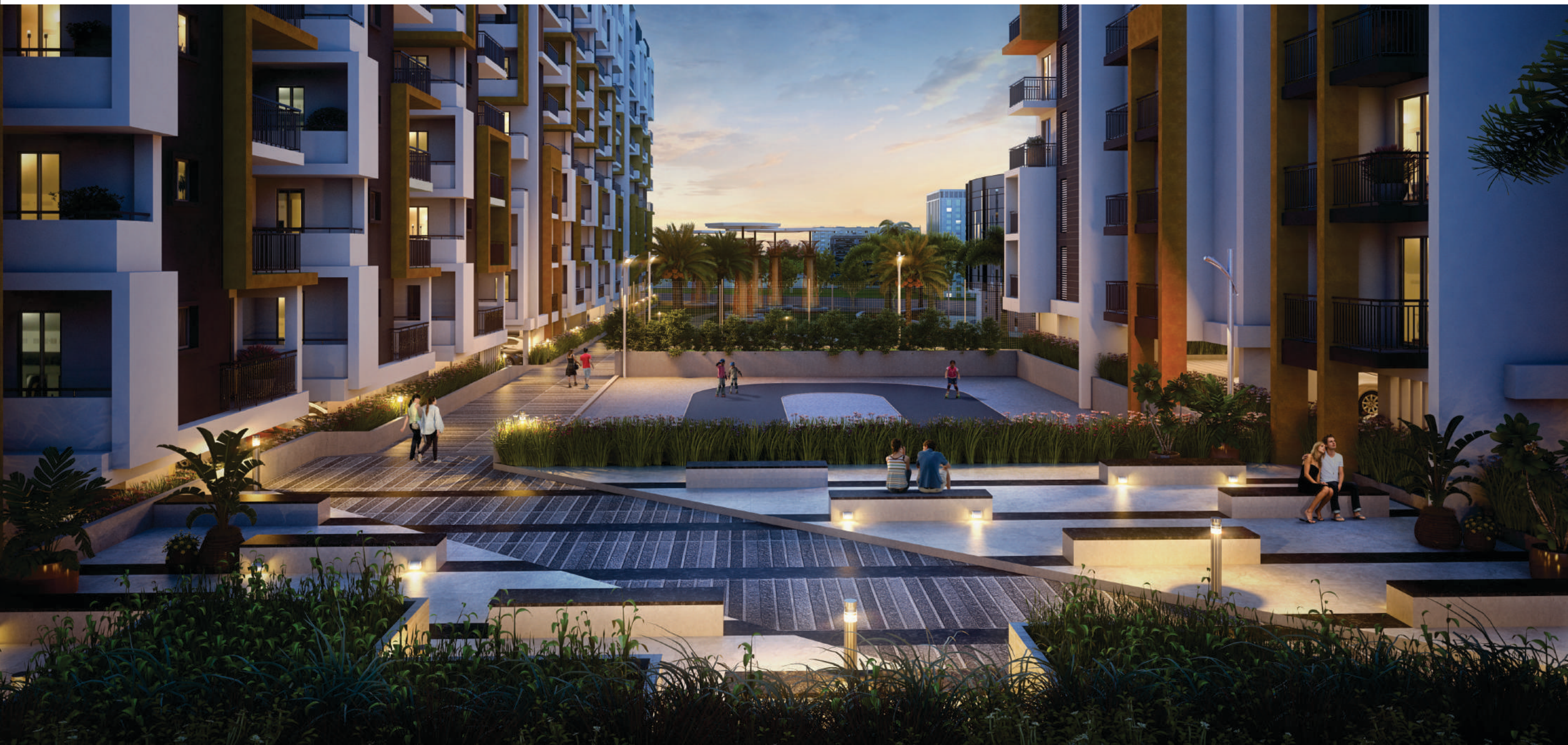
view towards outdoor games from seating plaza

REVEL IN THE SPLENDOUR OF YOUR SURROUNDINGS