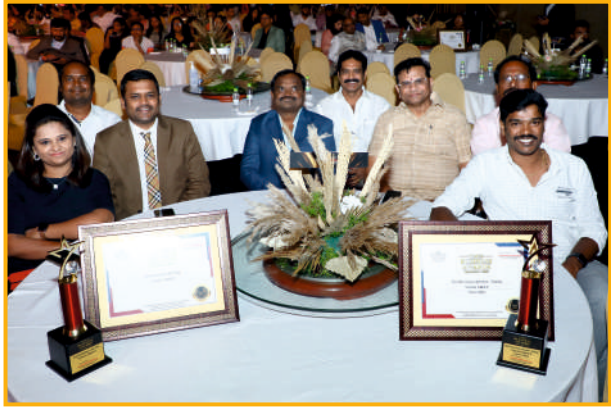
సినాదం Hyderabad · 25 Sep 2022 · Page 5