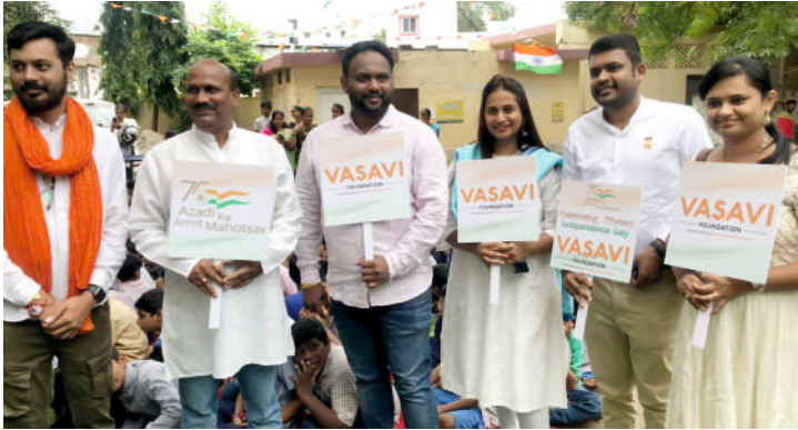
The Team of Vasavi Foundation at ZPHS, Macha Bolarum

Vasavi Foundation, the philanthropic arm of Vasavi Group, joined ZPHS, Macha Bolarum, to celebrate 75 Years of Independent India under the "Azaadi ka Amrit Mahotsav" campaign.