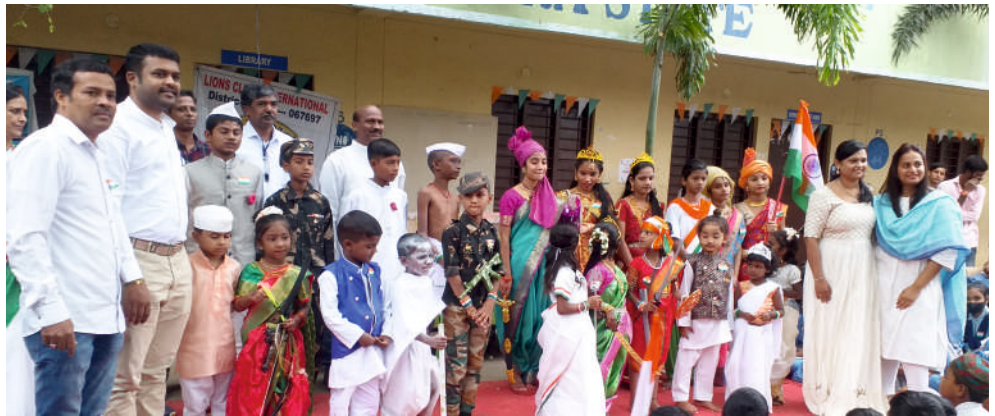
The enthusiastic Independence Day-themed Fancy Dress Participants