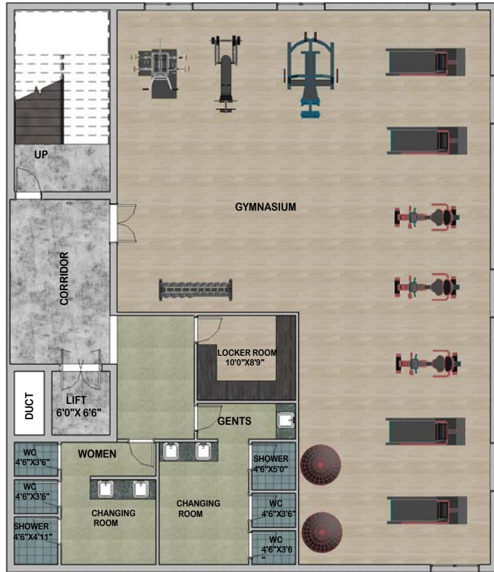
CLUB HOUSE FOURTH FLOOR